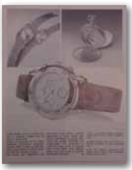
Press Coverage For Evaco