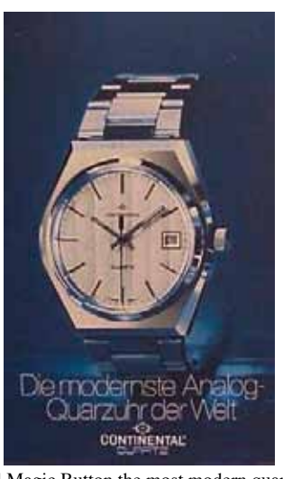
Continental Magic Button the most modern quartz watch in the eighties